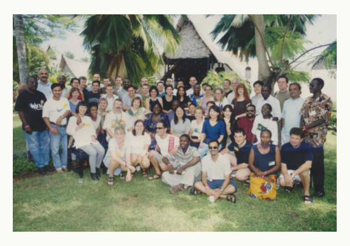
Nigeria, Mid-year conference, 1994